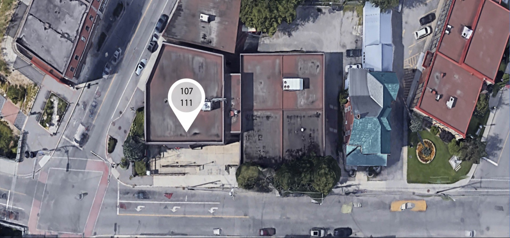
107-111 Maclaren E, Buckingham